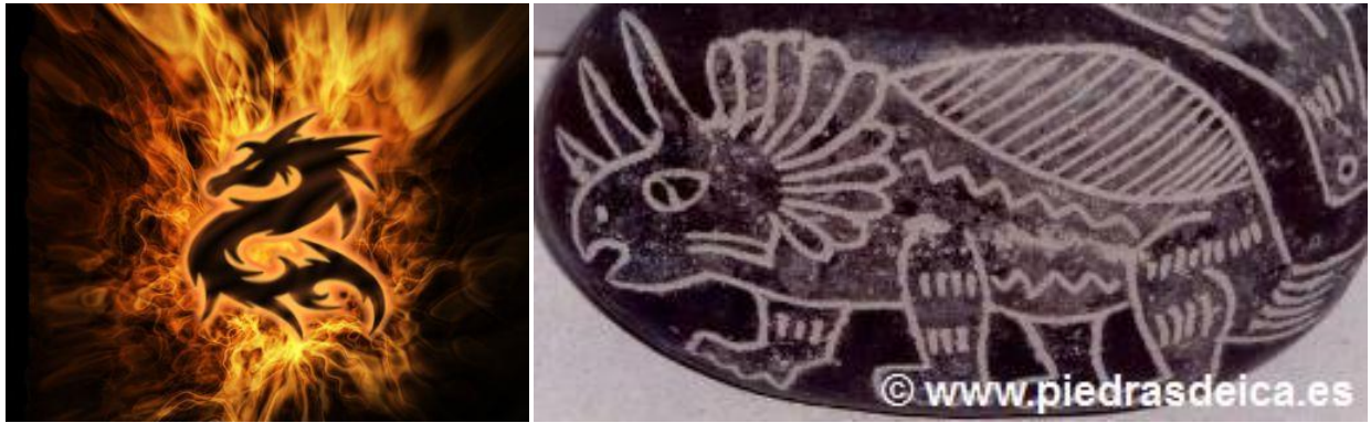
IMAGINARY FIGURE OF DRAGON ICA STONE OF TRICERATOPS AND IGUANODON

When I submitted the swirl photo for negative and filtered effects, I was surprised to see that at the top it appeared, a kind of triceratops head or dragon, like the ones we see in some Ica Stones or Asian legends. chance?