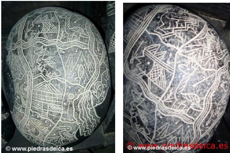
Ica Museum: Continent "B" Det.1. B

On the other hand, in the duplicate, there is only the Upper House, the lower house has disappeared, symbolism representative of the Kundalini "movement" of the Planet, as I mentioned.