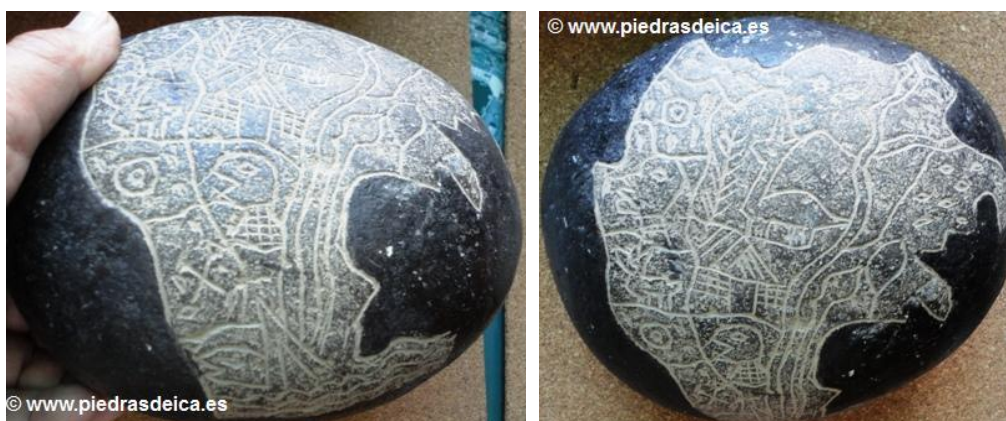
Duplicated: C1De. 1st C1