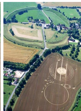
CROP CIRCLE ABEBURY MANOR, 15 and 22 JULY 2008