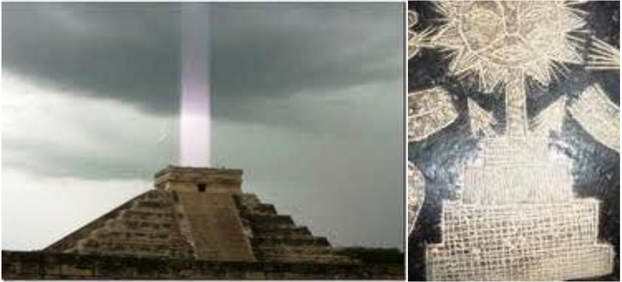
LIGHTNING IN PIRAMIDES: CHICHEN ITZA STONE OF ICA

One of the most forceful tests of the circulation of the flow of energies, we see in the photo of the Lightning in the Pyramid of Chichen Itza , in Yucatan, if we compare the images, we see that the Ica Stones we already anticipated the technique of the operation of the flows of Energy, between humans and Cosmos, but I did not realize that it contained this Message, until the arrival of the "duplicated", I could say, that perhaps it is that is the reason for that, first redacted the text, guided by an information "channeled", for a while later, come confirmation, in this case, in the form of Duplicate Stone.