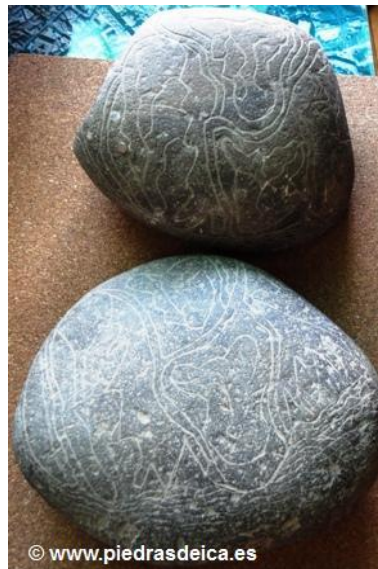
STONE AMERICAN CONTINENTS ICA MUSEUM AND DUPLICATES

Pros and cons on this subject, without catastrophic encouragement: