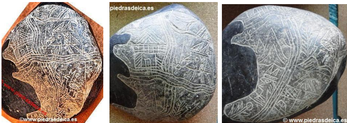
DUPLICADA: Continente B1 Det.1- B1 Det.2- B1

On the other hand, in the duplicate, there is only the Upper House, the lower house has disappeared, symbolism representative of the Kundalini "movement" of the Planet, as I mentioned.