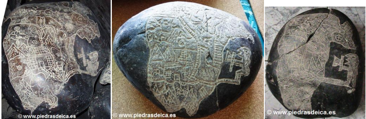
IcaMuseum: Continent "A" Duplicates: A1 A2

he will be subjected to the cosmic game of karma, the fears, phobias and all the deficiencies that implanted us to humans, when 95% of our powers were revealed to us, to control us and to meter us to the discipline of reincarnation and life experiences, so that, for thousands or millions of years we may recover our lost powers and divine essence.