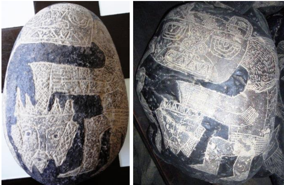
ICA STONES: DUPLICATES OF THE CABRERA MUSEUM

Let us analyze the size of the engravings, to find the differences that help us to counter the key of the Message, to in turn know if their destiny is our Humanity, as we will see below, comparing both Stones.