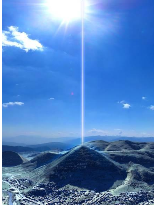
PYRAMID OF THE MOON-TEOTIHUACAN PYRAMID OF THE SUN-BOSNIA

In the pyramid of the Moon, in Teotihuacan, you can see at the top, a vortex-swirl, similar to the one I saw and photographed in Palpa, on my way to the Lost City and which caught my attention especially.