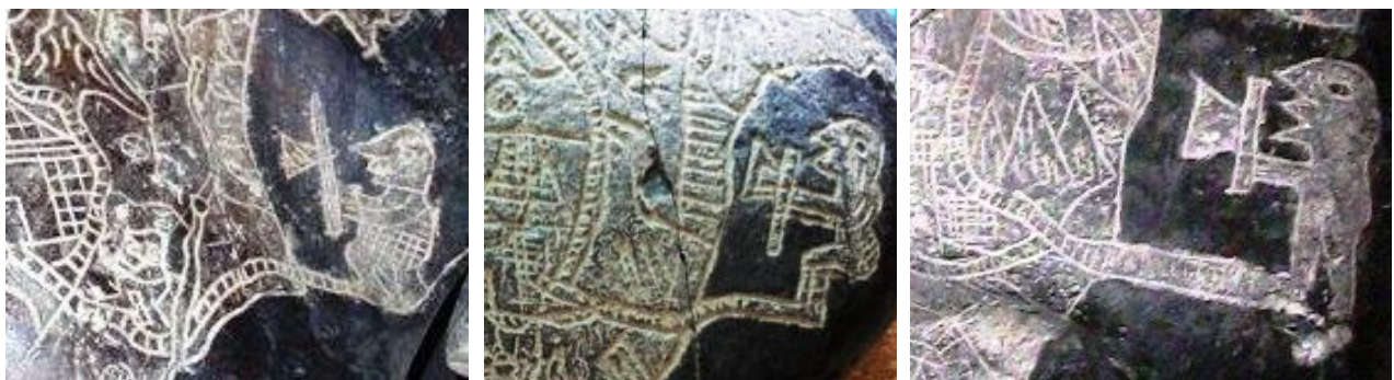
Det. HUMAN i ELITE (A) DET. ELITE ALONE, NO HUMANS (A1 and A2)

In the duplicates, the Superhumans are represented in two Stones, (A1 and A2), they no longer pursue the simple Human, as in the Museum Stone, nor do they access the House of Creation, symbolism of the disappearance or waning of Human Karma, where the Superhuman (The Elite), has blocked access to the House, being his only way, the staircase that takes him, upwards, away from the Karmic World of Humans.