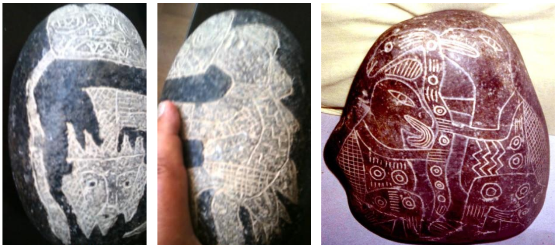
ICA STONES: OFICUS-DRACO COSMOLOGY DETAILS

An important detail of the end of the Elite's dominance is the symbolism of expulsion through the mouth of "the Serpent" , in the head of the Human, symbol Annunaki, from Nibiru, the cosmic origin of the dominant Elite.