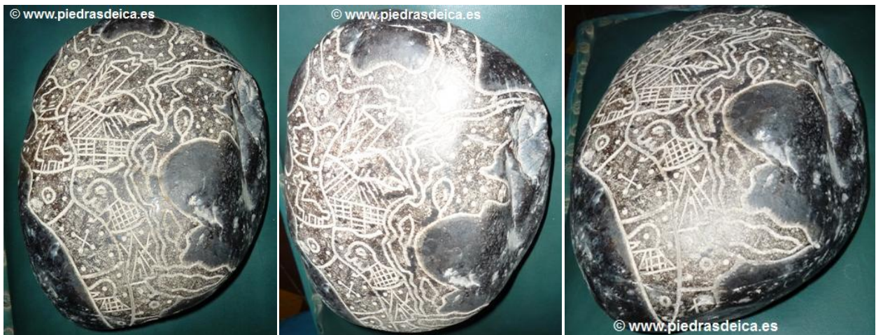
Museo Ica: Continente "C" It.1 c Det.2 C

Perhaps the most unique difference is that you don't see "Reptiles" in any of the Stones, a symbol that the Controlling Human (the Elite), loses power and the Simple Human, is detached from that ballast.