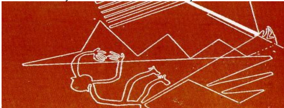
Nazca Monkey Pyramids Detail

But in the case at hand, the representation of pyramids goes beyond the classic version, they are showing us the multidimensional ones and their interaction with humans, all in code, of course!