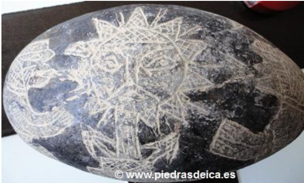
DETAIL OF THE GREAT CENTRAL SUN AND HUMANS INSUFFLATION ENERGY

The system of energy flows is the reason that explains, why when you visit ancient archaeological centers as it happens in Egypt, Peru or Greece , you connect with the energy vortices of their structures and notes that your cellular memory is "activated", even from memories or experiences of an ancestral past, hidden in our veiled brain.