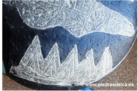
Crop Circle Owslebury 2012 Detail of Ica Stone Pyramids