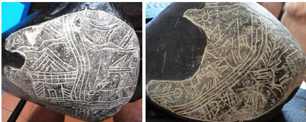
DUPLICADAS: Det.3- B1 Det.4-B1

When the lower house of "hard" karma disappears, only the karma of the Higher House will remain, more suited to the Ascension of the new Humanity, which will recover some of the veiled powers, approaching that of Glyptolithic Humanity, as we see in the